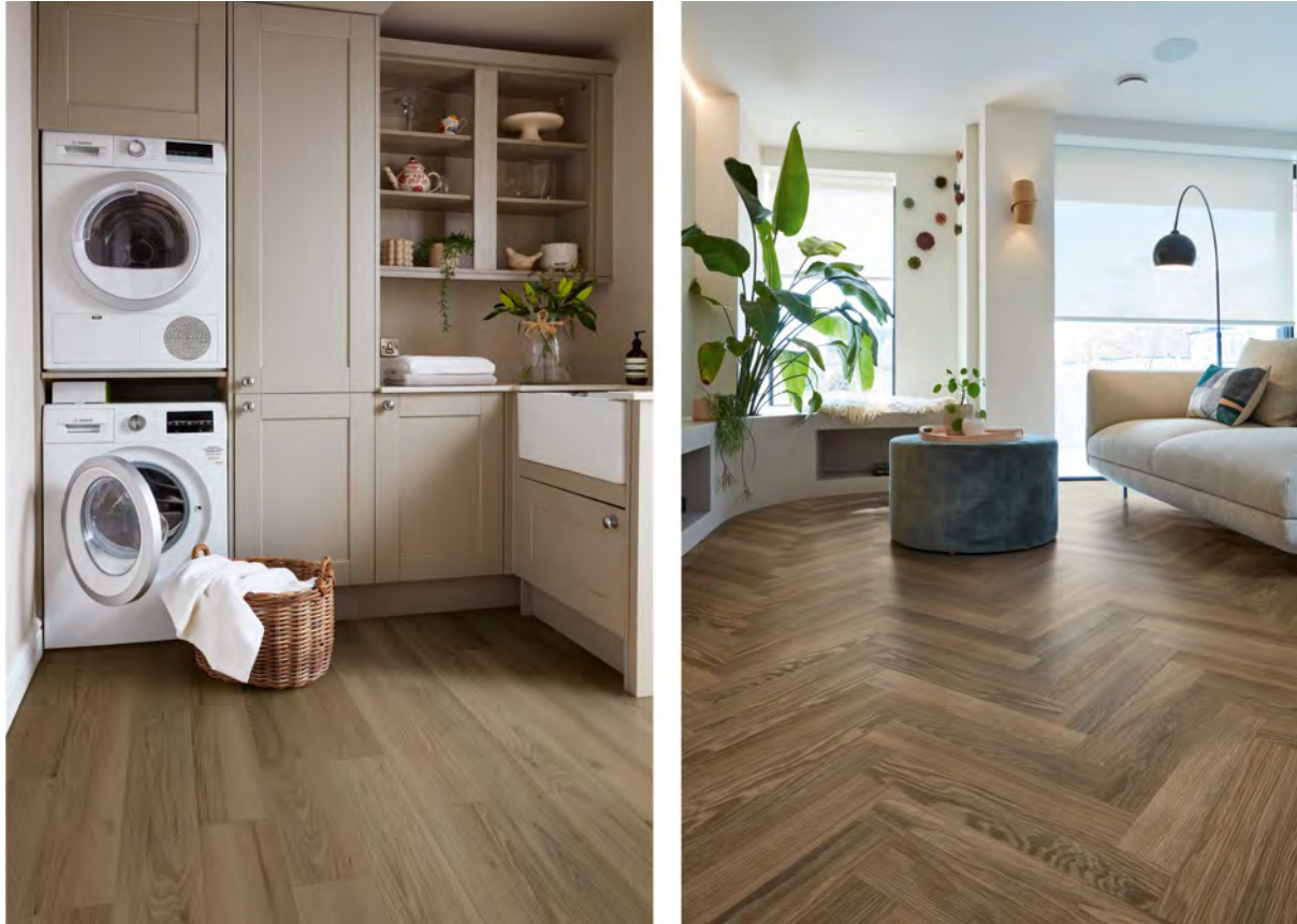
Above: Duxbury Acacia 36" x 6" plank (left) and Cocoa Limed Oak 36" x 6" full plank laid in herringbone (right), both from £31.99 per m 2 , Karndean's Knight Tile collection.

Duxbury Acacia: The boldest option in the new range, this design channels the strength and character of reclaimed shipbuilding timber. With striking undertones of blue, green and grey, it makes a standout statement in contemporary kitchens or moodier, masculine bedrooms.